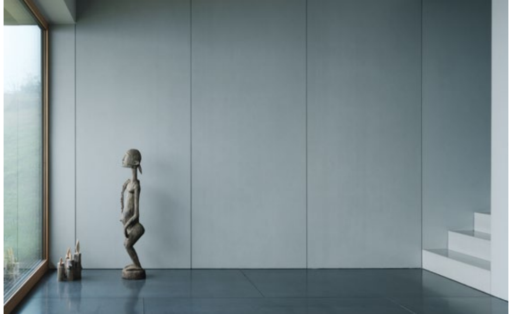
concrete skin for interior design