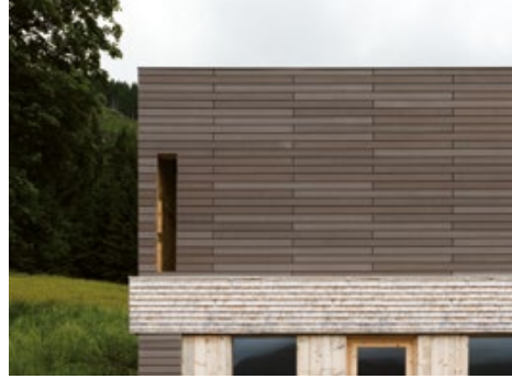
öko skin flex 125 mm, terra, horizontal installation (1/2 shifted), screwed on wooden substructure