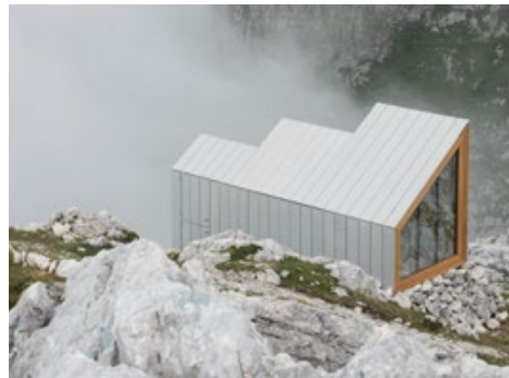
öko skin flex 147 mm, silvergrey, vertical installation, screwed on wooden substructure