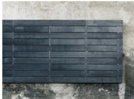
Coming soon! öko skin 147 mm, anthracite vintage, horizontal installation (1/2 shifted), glued on aluminium substructure