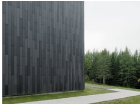
öko skin 147 mm, anthracite, vertical installation (1/3 shifted), screwed on aluminium substructure